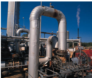
in chemical plants